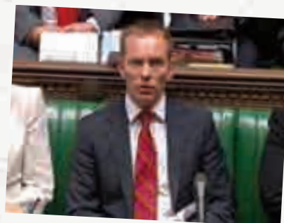
Chris Bryant MP

As a ‘stand-alone’ bill, Mr Bryant’s proposals are unlikely to become law, but he may try to ‘piggy-back’ his proposals on the Education Bill, to give them a stronger chance of becoming law.