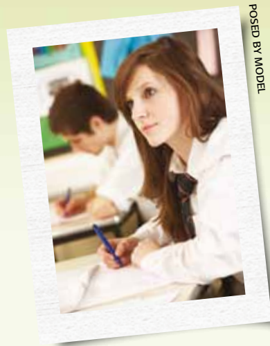
POSED BY MODEL