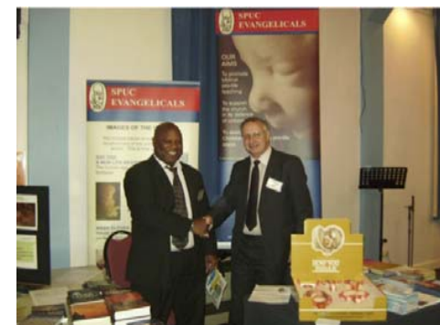
Our conference stall